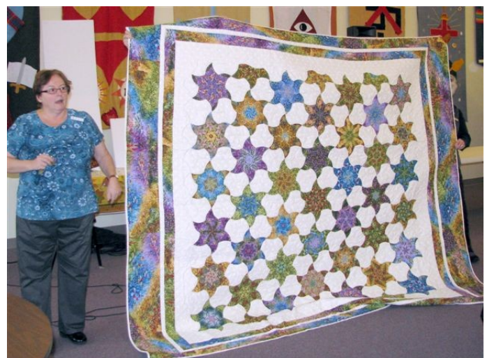
Diane Trottier's One Fabric Wonder is Breathtaking