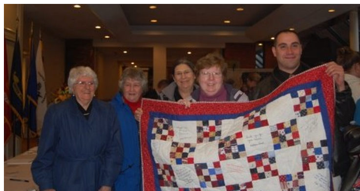
A shot from the Quilts of Valor presentation