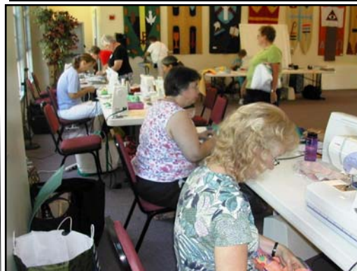
July FIT Quilt Workshop

Focus on your strengths, not your weaknesses. Use your talents to advantage. Don't try to "force a square peg into a round hole."