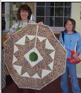
At left: Projects for Quilter’s Delight Weekend in Tilton/Franklin — November 9 –11.

I'd be happy to take suggestions for the types of books you'd like to see in our library. As always, donations are welcome but, please, no periodicals dated before the year 2000.