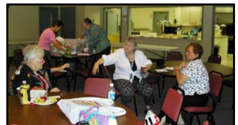
At one of our summer meetings.