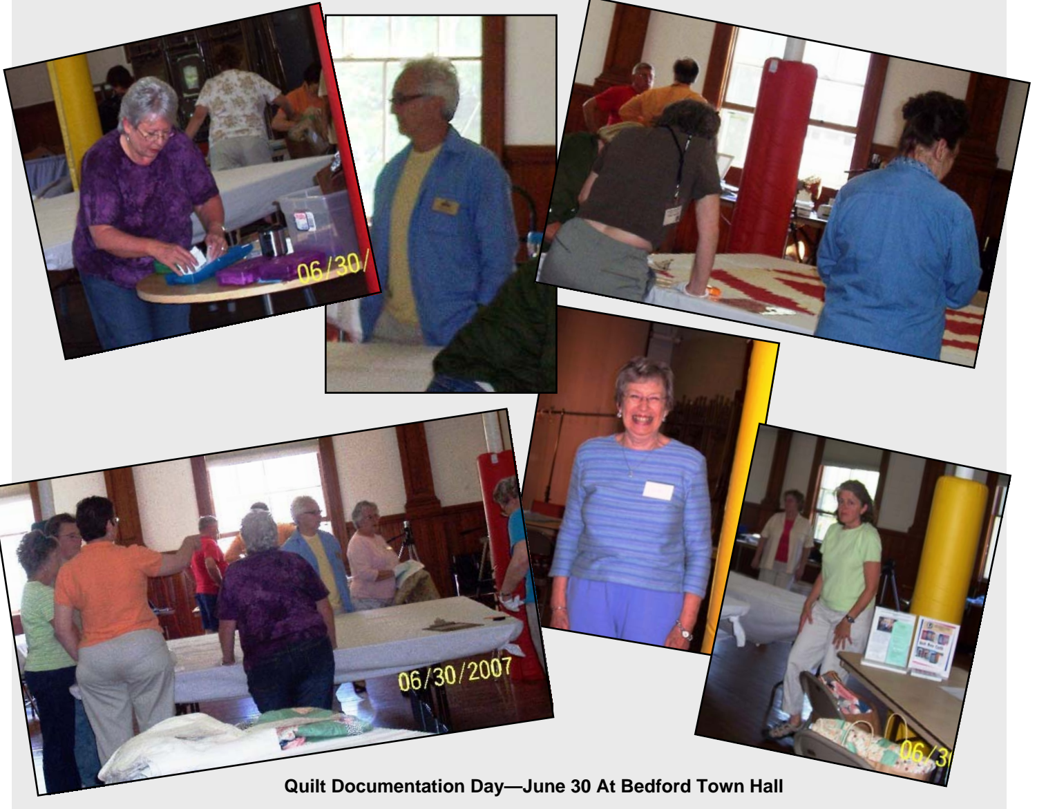
Quilt Documentation Day—June 30 At Bedford Town Hall

Bedford Friendship Quilt Guild PMB #108 176 Route 101 - Unit B3 Bedford, NH 03110