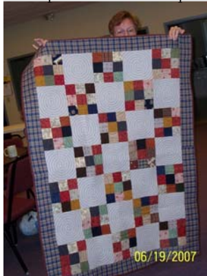
Barb peeks over a FIT quilt

for a teenage boy or girl (size about 45" by 60"). Why not ask a friend to help you make a "teenage" quilt? It'll go together twice as fast..