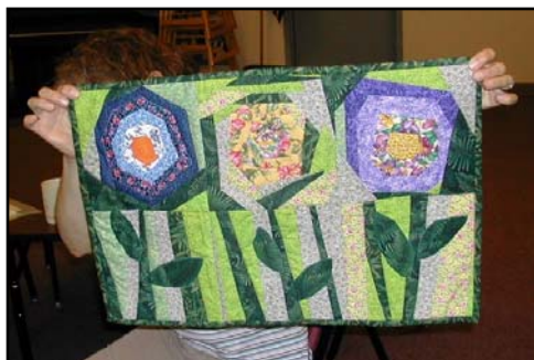
Some of you have been busy making mini-quilts