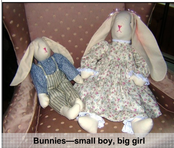
Bunnies—small boy, big girl

If you want to bring your own fabric for a girl bunny, you will need a yard of muslin, 1 1/4 yards of material for a dress, and 3/4 yard for