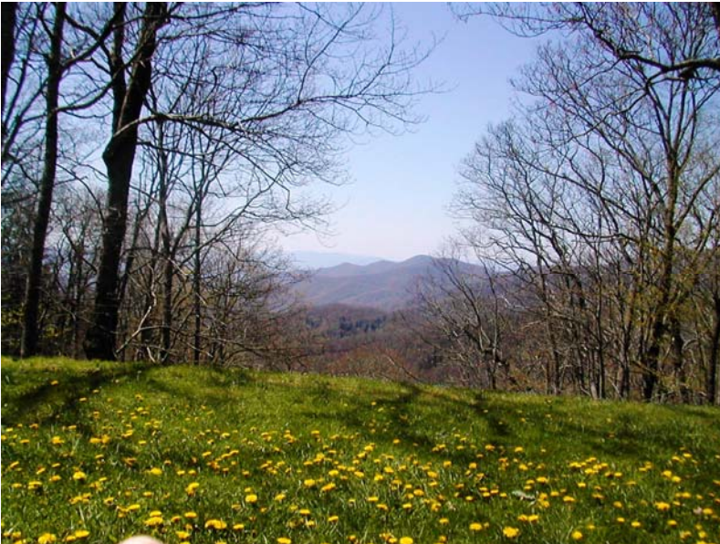
The Great Smoky Mountains on a beautiful day in late April.

From the Editor: No meeting in May means no photos of the meeting. So here are two from my spring vacation.