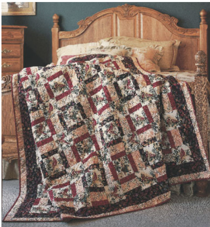
Warm Wishes bed quilt