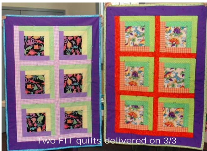
Two FIT quilts delivered on 3/3

writing and anxiously awaiting the shipment. In the meantime, consider visiting their website to learn more about them.