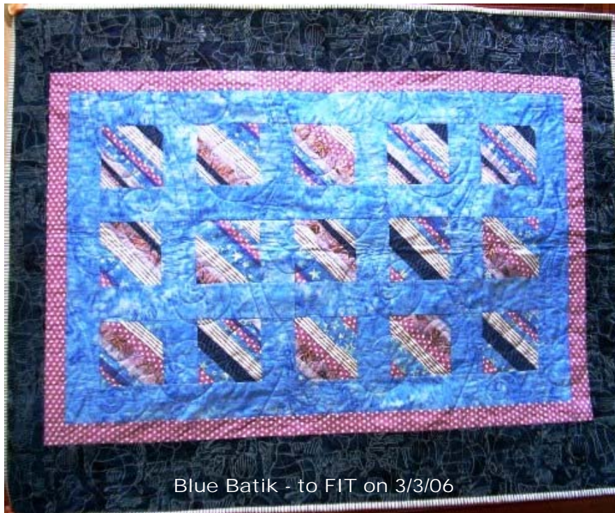
Blue Batik - to FIT on 3/3/06

not distort grain of the fabric by ironing with long strokes. (From Rachel T. Pellman, "Tips for Quilters")