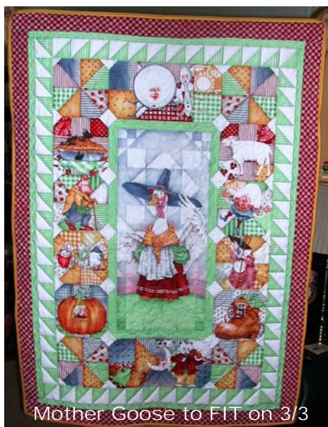
Mother Goose to FIT on 3/3

A year ago I made a quilt for my daughter’s 21st birthday. I was surprised at how emotionally invested I was in that project. But then, it was for someone I know and love. I hope that we can become emotionally invested in making quilts for Families in Transition. Even though the recipients will never know the individual(s) that made the quilt, I think they’ll still feel the love that went into it.